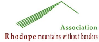
Rhodope mountains without borders