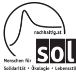
SOL – People for solidarity, ecology and lifestyle, Austria